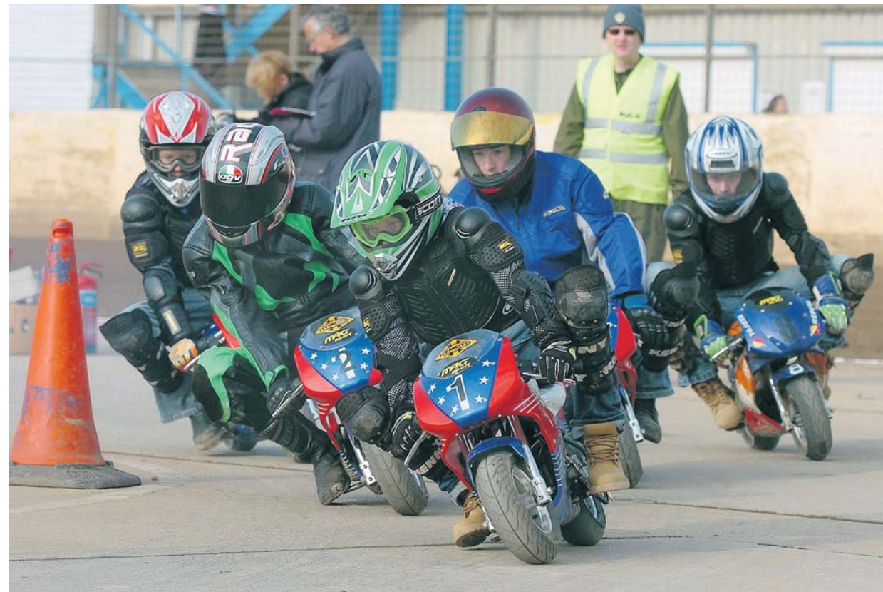
Tussling for position: Close action from the final meeting of the Moto KL season at the Norfolk Arena

Racing was held once a fortnight on Thursdays and the main MHB Services League was won by Dusty Devils, while the Novice